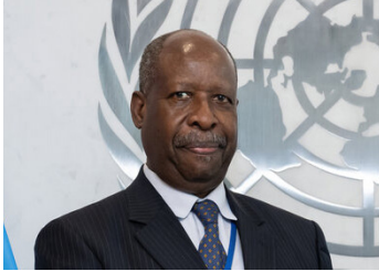
Leonardo Santos SIMAO

Special Representative of the United Nations Secretary-General for West Africa and the Sahel and Head of UNOWAS/CNMC