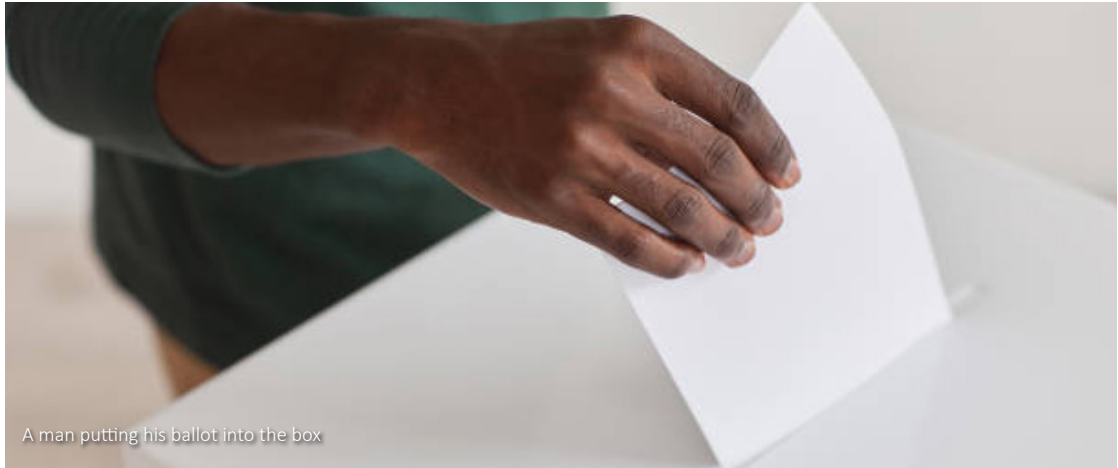
A man putting his ballot into the box

Three million Sierra Leonean voters cast their ballots on Saturday June 24 to choose their new president, parliamentary and municipal representatives. They all hope that this fifth election since the end of the civil war in 2002 will foster the consolidation of peace and development.