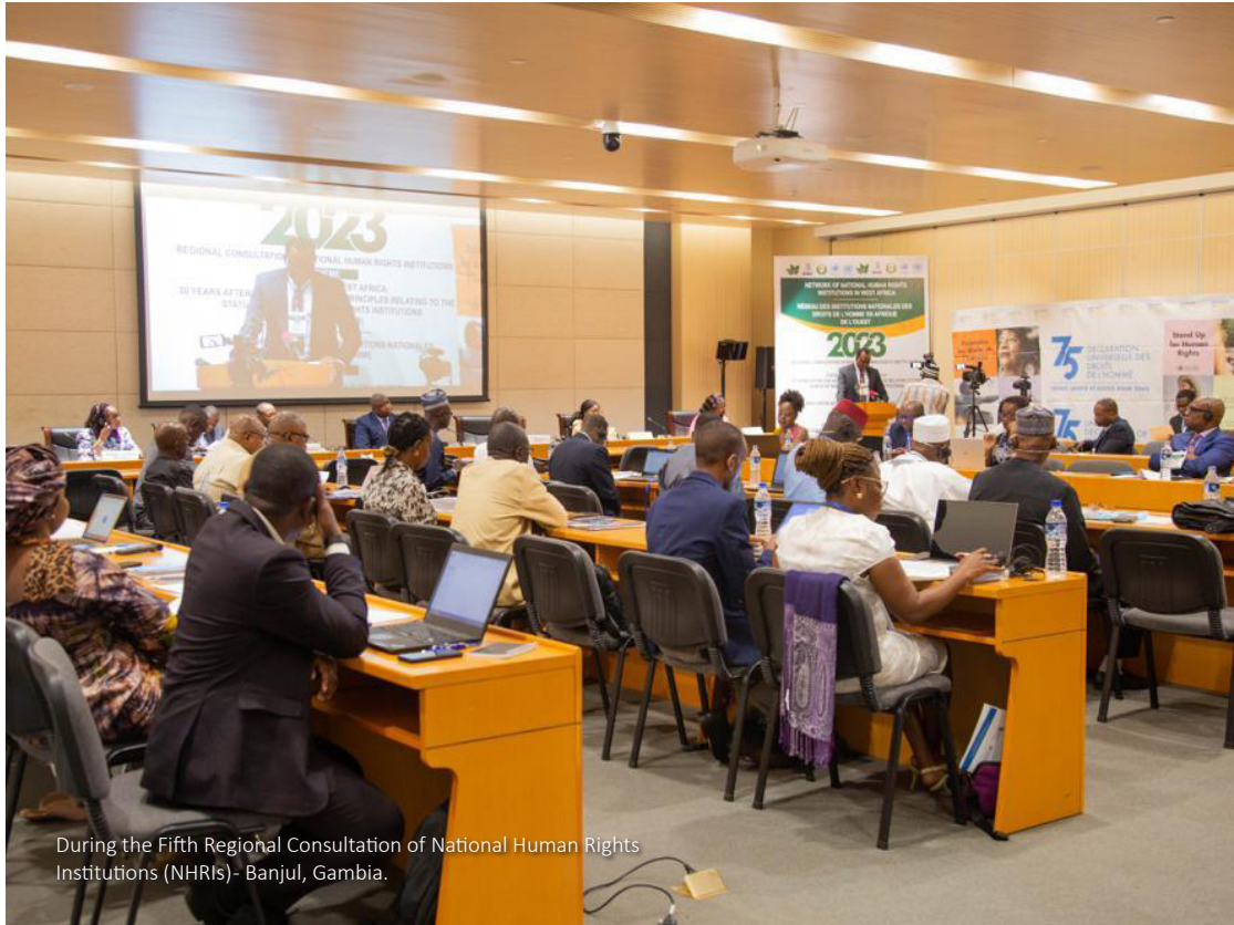
During the Fifth Regional Consultation of National Human Rights Institutions (NHRIs)- Banjul, Gambia.

Between the 7-9 June 2023, the Fifth Regional Consultation of National Human Rights Institutions took place in Banjul, The Gambia. During these three days, fourteen representatives from West Africa met to share their experiences and strengthen regional cooperation in order to effectively promote Human Rights in the sub-region.