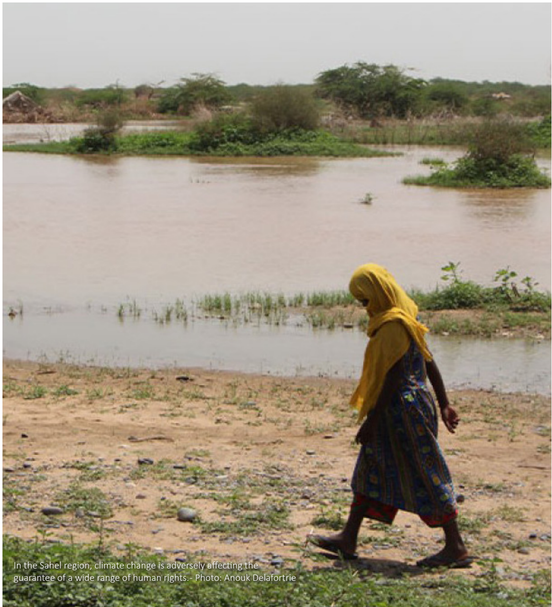
In the Sahel region, climate change is adversely affecting the guarantee of a wide range of human rights.

This year marks the seventy-fifth anniversary of the Universal Declaration of Human Rights (UDHR). With NHRIs rooted in the core values of the UDHR, participants discussed the progress made, as well as the challenges and prospects ahead.