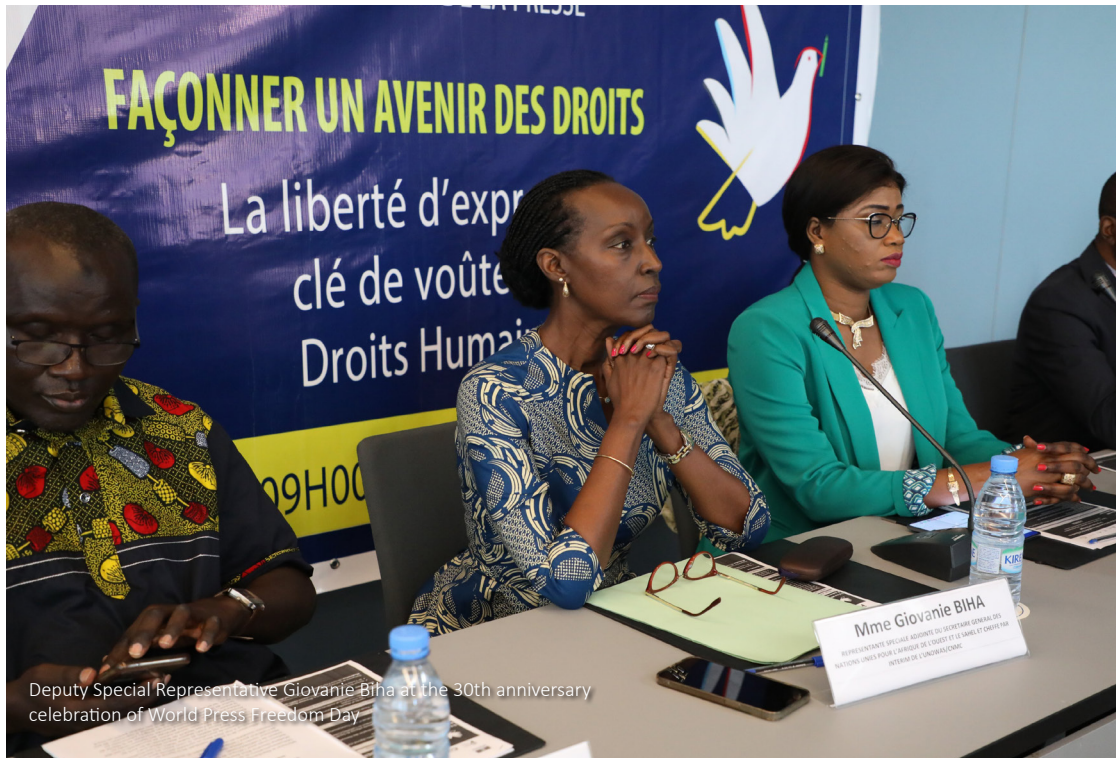
Deputy Special Representative Giovane Biha at the 30th anniversary celebration of World Press Freedom Day

Some sixty stakeholders from the media sector took part in a discussion forum organized on 3 May 2023, in Dakar, to take stock of the state of freedom of expression in Senegal, and to assess the challenges and opportunities facing the media sector.