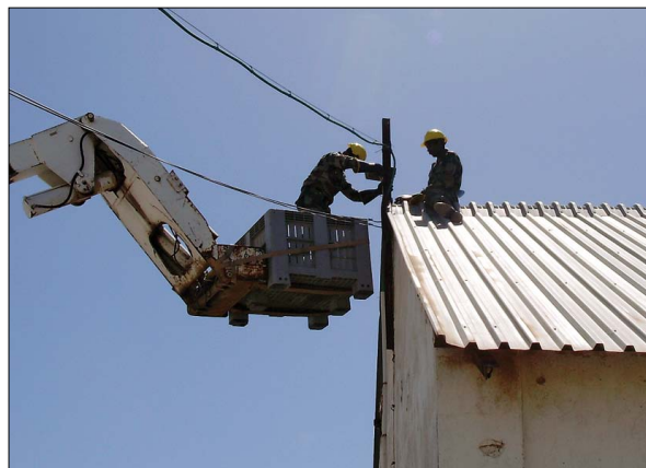
Electrical repair done by Indian Engineers