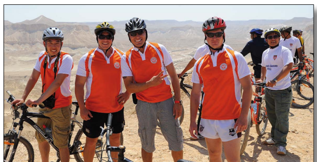
... and outdoor in the Negev desert