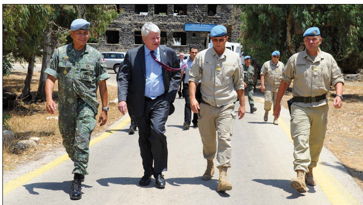
Line tour in Qunaitra