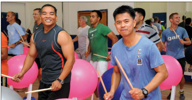
Drumming in the rhythm of disco music