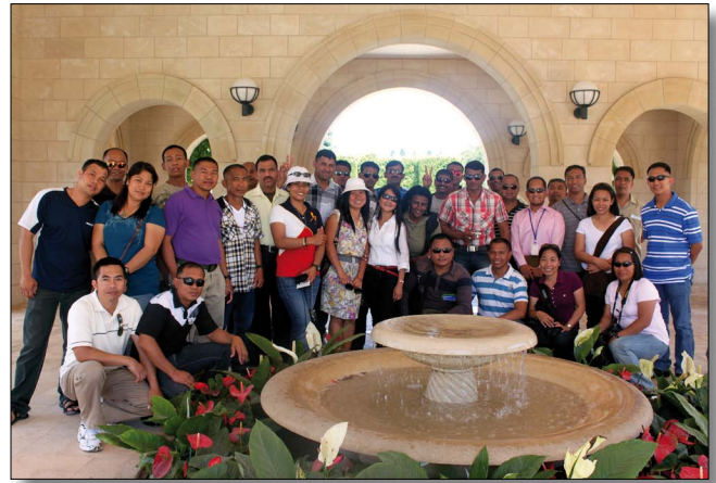
The Bahai Shrine gardens in Akko