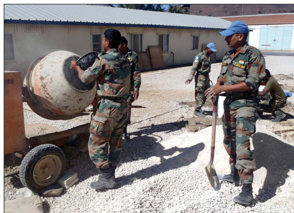
Grounding work for freezer container