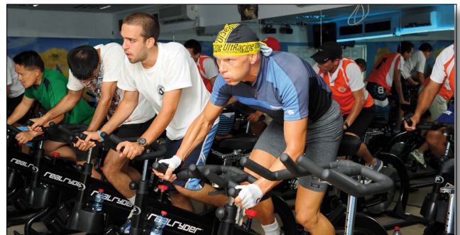
Biking experience indoor ...