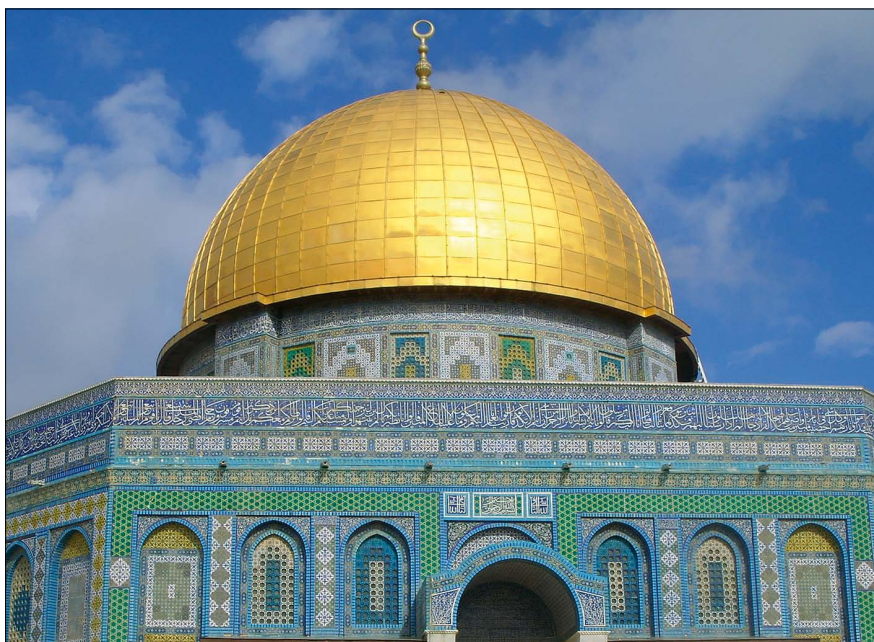
Jerusalem or Al Quds, at any time a special place to be discovered

One-day trips have been organized to visit various places in the mission area primarily to learn and appreciate the history, culture and geography of the host countries. In November last year, more than 80 military and civilian UNDOF personnel participated in trips to the Nimrod Fortress, to Damascus and the Sea of Galilee. In the first two months this year, more than 120 personnel had visited different historical places as a part of organized recreation trips. It enhanced their