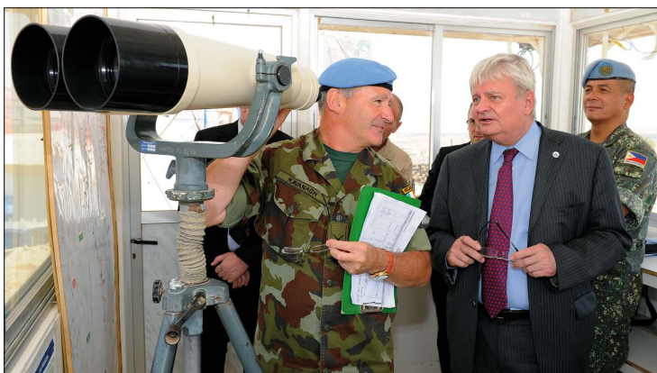
Monitoring at UNTSO OP 72