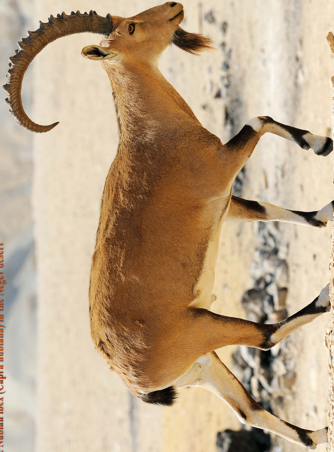
The Nubian ibex ( Capra nubiana ) in the Negev desert