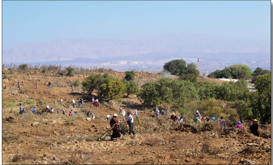
Syrian locals picking up pieces of woods in preparation for the upcoming winter seasons

LtCol Ramon C. Estella, the PHILCON Contingent Commander, decided to synchronize all operational deployments of troops in PHILBATT's Area of Opera-