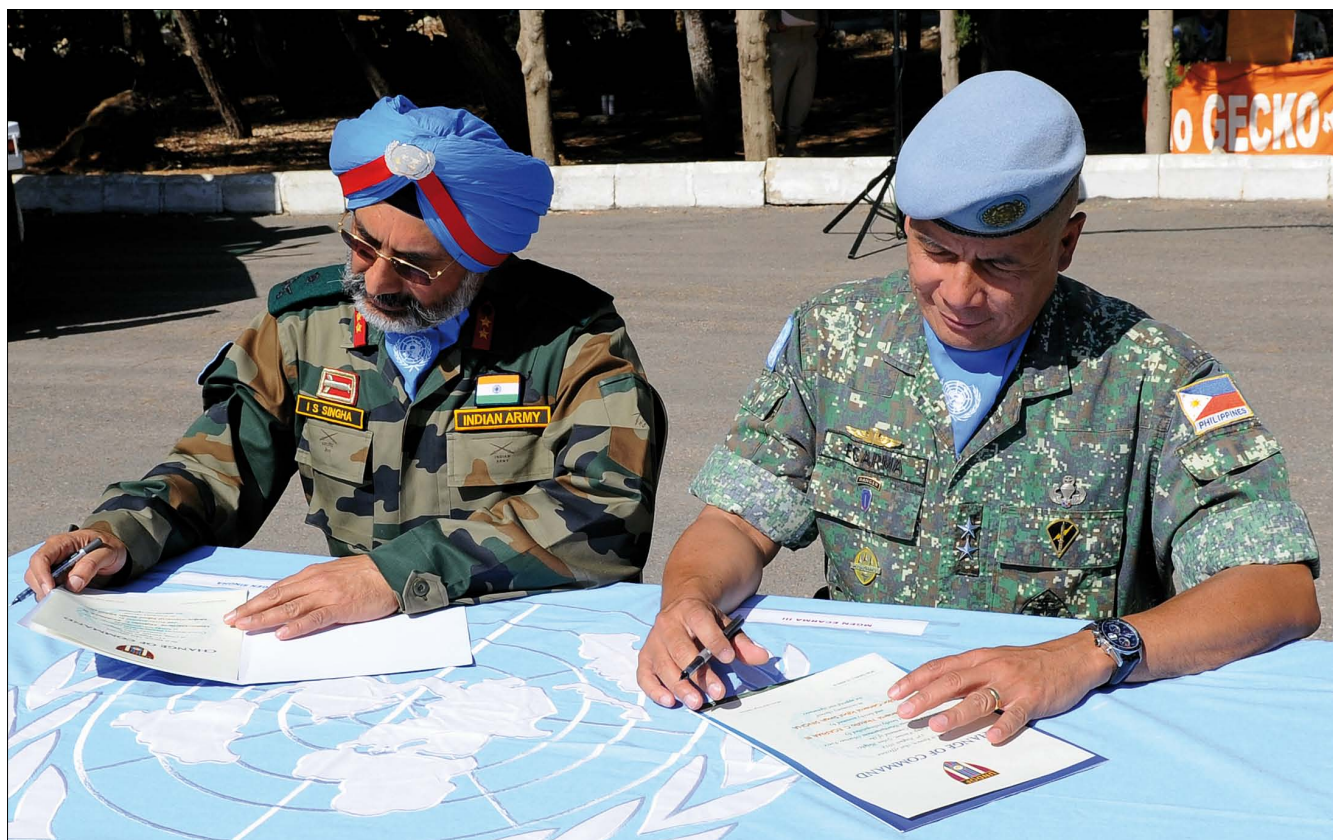
Signing of the COC certificates