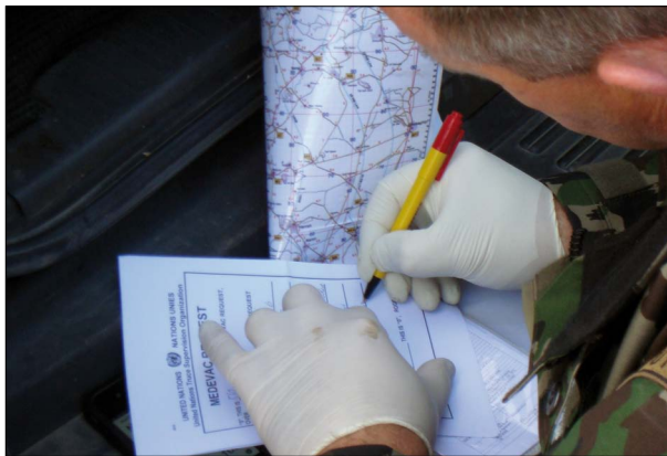
Documenting the medical situation

The test begins with a simulated visit by a high ranking officer that requires the UNMO to deliver safety and security briefings and an