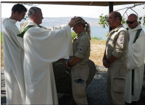
Confirmation ceremony at the “Jesus Lake”