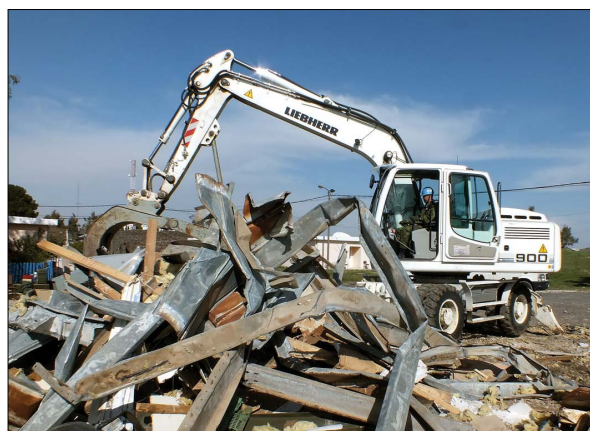
LOGBATT's efforts in the Facility Reduction Program