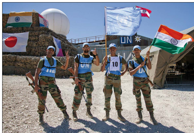
Mission accomplished: INDCON soldiers at Posn HH

Usually, it is a two day venture starting in Qunaitra at Posn 27 (2 nd Coy/AB) with approximately 18 kilometers in undulated terrain to be dealt with before you finish the first stage at Posn 10 (3 rd Coy/AB). But due to the prevailing situation in the AOS, the AUSBATT March had unfortunately to be cut down to the second day's challenging 22 km march in the unforgiving steep and rough terrain.