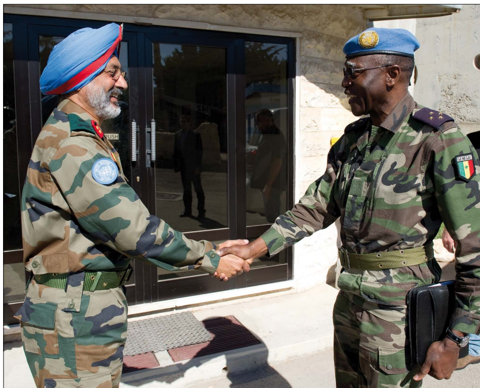
The new FC UNDOF welcomes the highly distinguished guest

LtGen Gaye was taken on a tour in the Area of Separation where he was shown the terrain and key features of interest to UNDOF. The tour also incorporated a visit to UNTSO OGG OP 72 and UNDOF Posn 37. The visit officially ended with a delicious Austrian lunch and the presentation of a memento by MGen Singha.