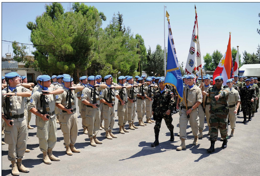
Parade square: Troops saluting the Colors

Article by Capt Ekkehard Gröppel, SOPR