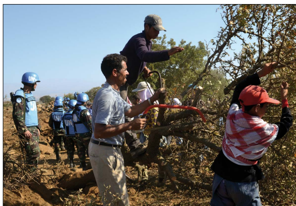
Collecting the woods monitored by PHILBATT Peacekeepers

Once again the Philippine Contingent successfully prevented a probable sensitive violation against the agreement. The PHILBATT Peacekeepers fulfilled their tasks and proved their skills in a very professional way – therefore worth of being part of this prestigious UN peacekeeping mission. Salute!