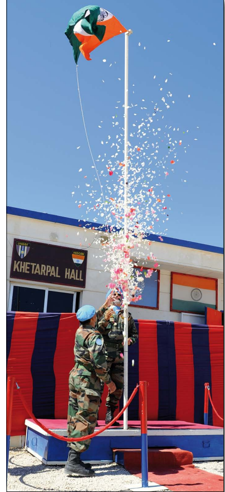
Unfurling of the Indian National Flag

which thin metal discs are fitted as well as the “Karagattam” from the state of Tamilnadu. That is a Tamil folk dance involving the balancing of clay or metal pots or other objects on the dancers head.