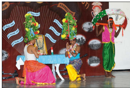
The show ...

The presentation was followed by a cultural display comprising of different traditional Indian dances: “Bhangra”, a folk dance coming from the state of Punjab which has been practiced since 1880, “Lezium” from the state of Maharashtra, named after a wooden idiophone to