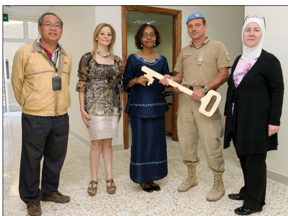
The key is handed over to the Civilian Staff