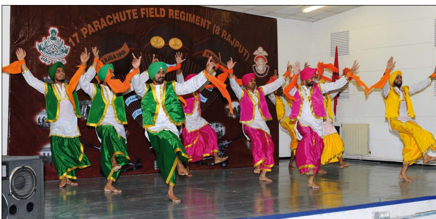
... with Indian traditional dances at Khetarpal Hall