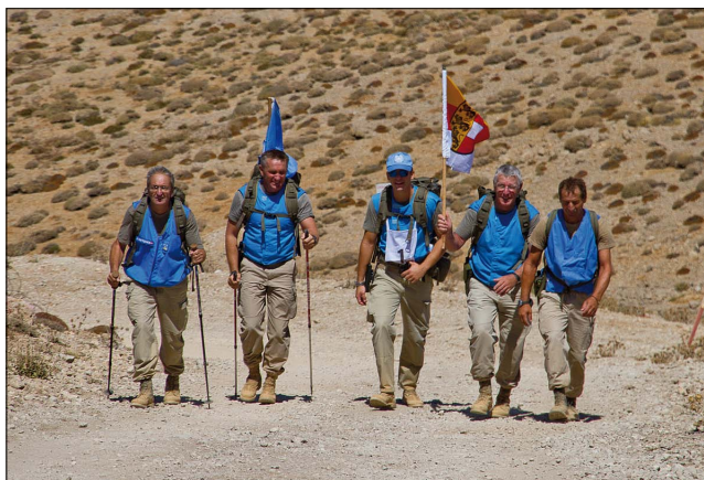
Powerful Austrians almost succeeded

Twice a year the AUSBATT March takes place. It gives all participants the opportunity to prove their fitness as well as their skills in patrolling through mountainous terrain. In mid-September the time has come when Mount Hermon called again.