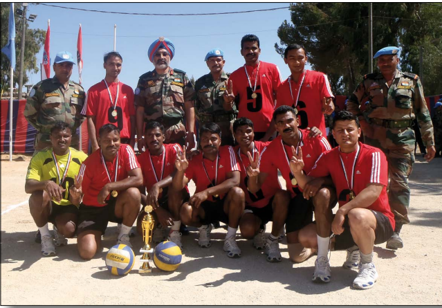
The Indian volleyball players were the best