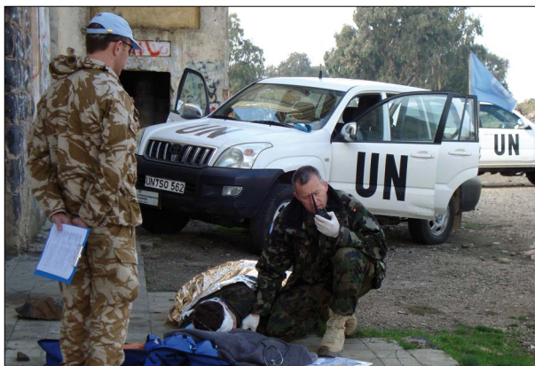
Call for UNDOF medical evacuation

mission essential tasks and medical responses for their summative operational effectiveness test: the "Chief's Challenge". That is a five hour long testing sequence that cov-