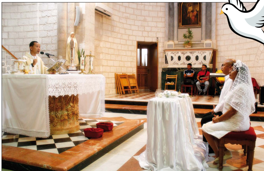
Solemnly celebrating Mass at the Wedding Church in Cana

The renewing of a marriage is a special act that shows the love and trust of a wife and a husband. The PHILBATT Commanding Officer and National Contingent Commander gave this promise again to his wife at a holy site in the mission area.