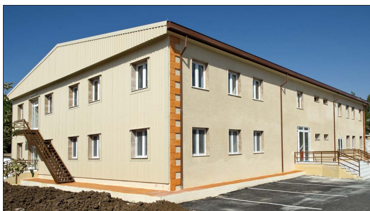
A proud project is completed: Office Building No. 33