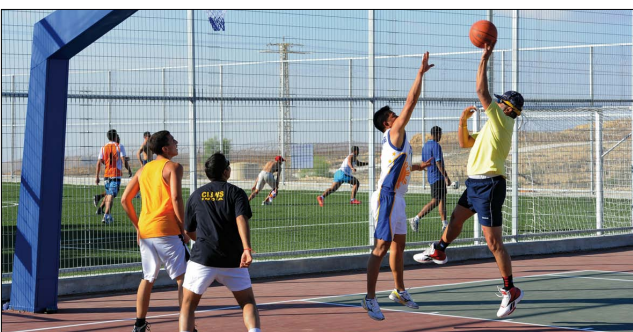
FC UNDOF going for a score